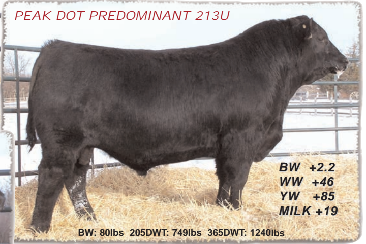
PEAK DOT PREDOMINANT 213U

The April 7, 2010, sale will feature 130 performance bulls from our fall program as well as a powerful set of yearling bulls from our embryo program.