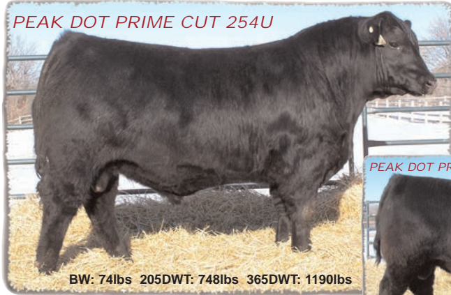
PEAK DOT PRIME CUT 254U

BW: 74lbs 205DWT: 748lbs 365DWT: 1190lbs