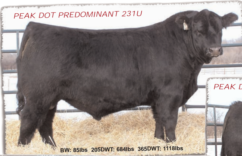
PEAK DOT PREDOMINANT 231U

BW: 85lbs 205DWT: 684lbs 365DWT: 1118lbs