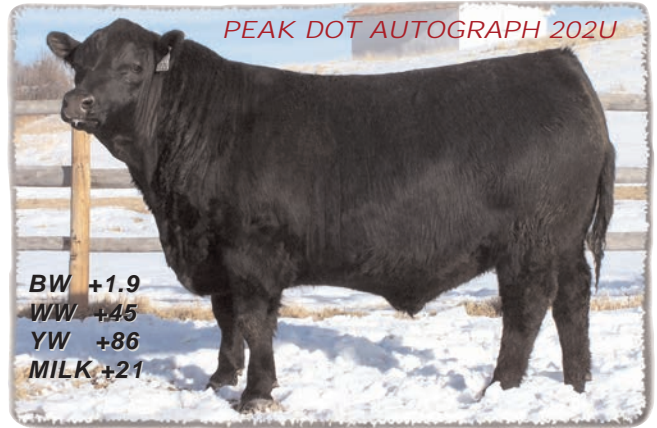
PEAK DOT AUTOGRAPH 202U

BW: 78lbs 205DWT: 708lbs 365DWT: 1214lbs