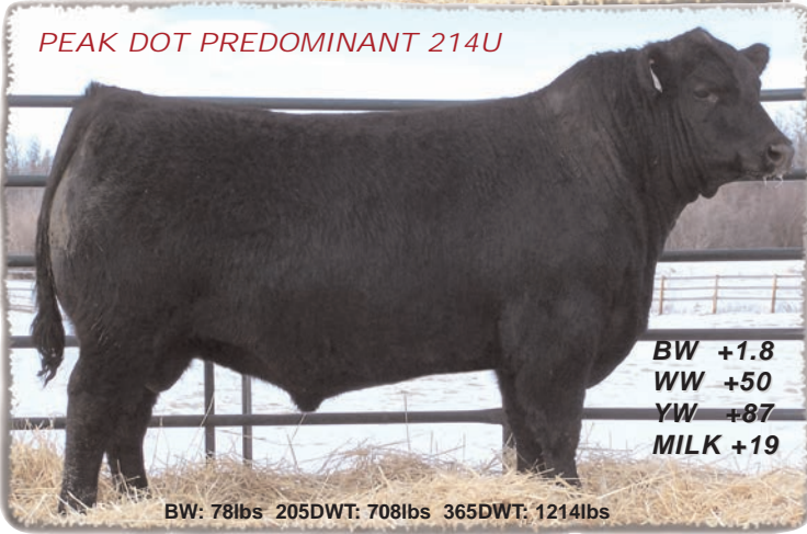
PEAK DOT PREDOMINANT 214U

BW: 80lbs 205DWT: 749lbs 365DWT: 1240lbs